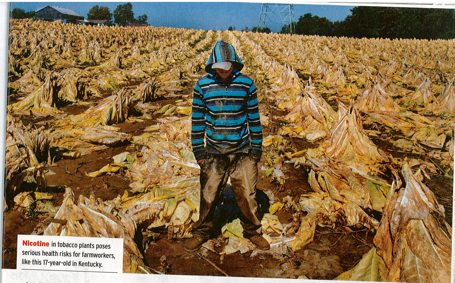
Nicotine in tobacco plants poses serious health risks for farmworkers, like this 17-year-old in Kentucky.

and called her “princess” and “baby.” Most tobacco farms, she says, have no bathrooms, and she can’t make herself go in the woods, as other women do.